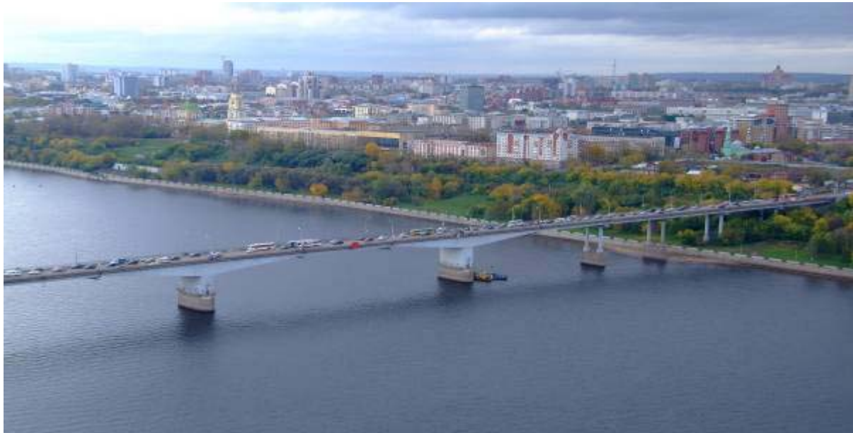
Perm, bridge over the river Kama

The core of this project is to create lively and sustainable partnerships among artists, cultural managers and cultural institutions from the cities of Perm and the European Capitals of Culture 2010 Duisburg (part of Ruhr2010) and Pécs.