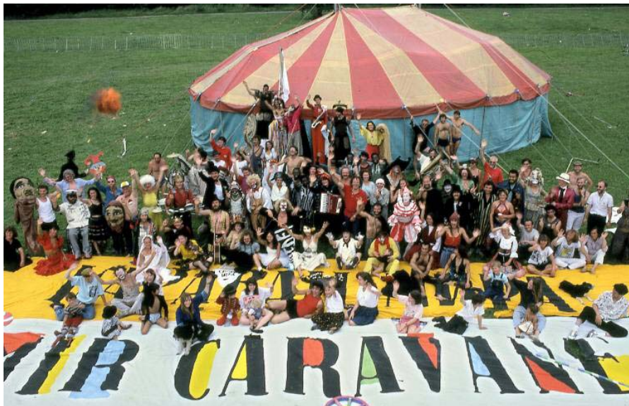
MIR CARAVANE IN WARSAW, June 1989