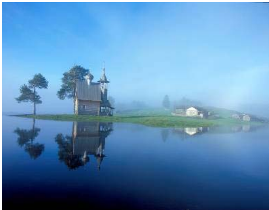
Glazovo village at white nights, Kenozero park

The leading idea of the proposed project is to organize an international cultural festival, which will be a great celebration of the wealth and diversity of culture and art of the Kenozero area (eastern part of Archangelsk region) by bringing together local and international artists, art designers, musicians, masters in handicrafts, experts in cultural revival and restoration from European Russia, the Czech Republic, Estonia and Norway.