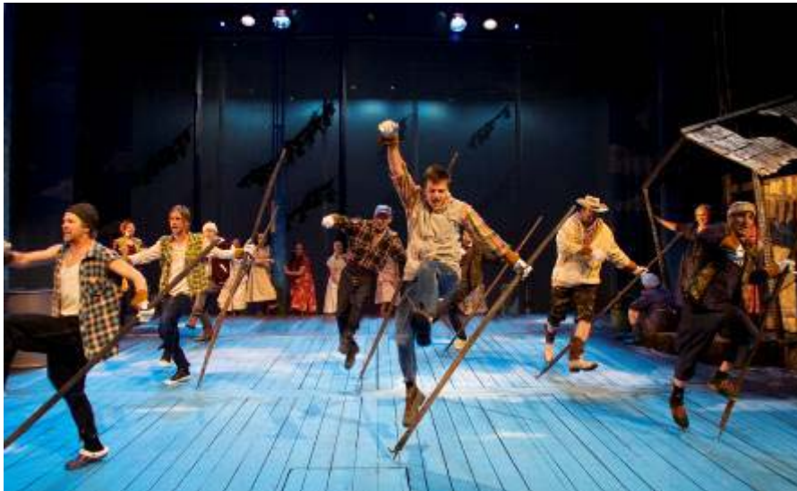
Tukkijoella (The Loggers) by Teuvo Pakkala, directed by Pentti Kotkaniemi. Turku City Theatre in 2009.