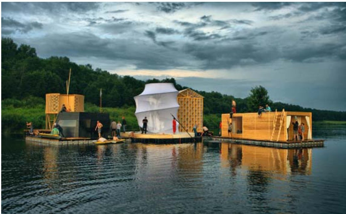
Festival of landscape architecture "ARCHSTOYANIE 2008". Main theme: "Noah's Ark". Rafts.

The festival will be accomplished by master-classes, work-shops and professional exchange tours to France and the Netherlands. This project will be a unique experience for both Russian and European participants. European artists will have an opportunity not only to exhibit their projects, but also to share experience of media technologies implementation as well as to arise interest and stimulate creative energy for forming of new generation of architects and artists, practicing this type of art in Russia. For Russian participants this project has a strong educational basis and opens a perspective to more profound analyses of Nikola-Lenivetz village landscape and organization of the territory of the forming open-air museum and developing of its infrastructure. The project will include itinerary photo exhibition and publication of a catalogue.