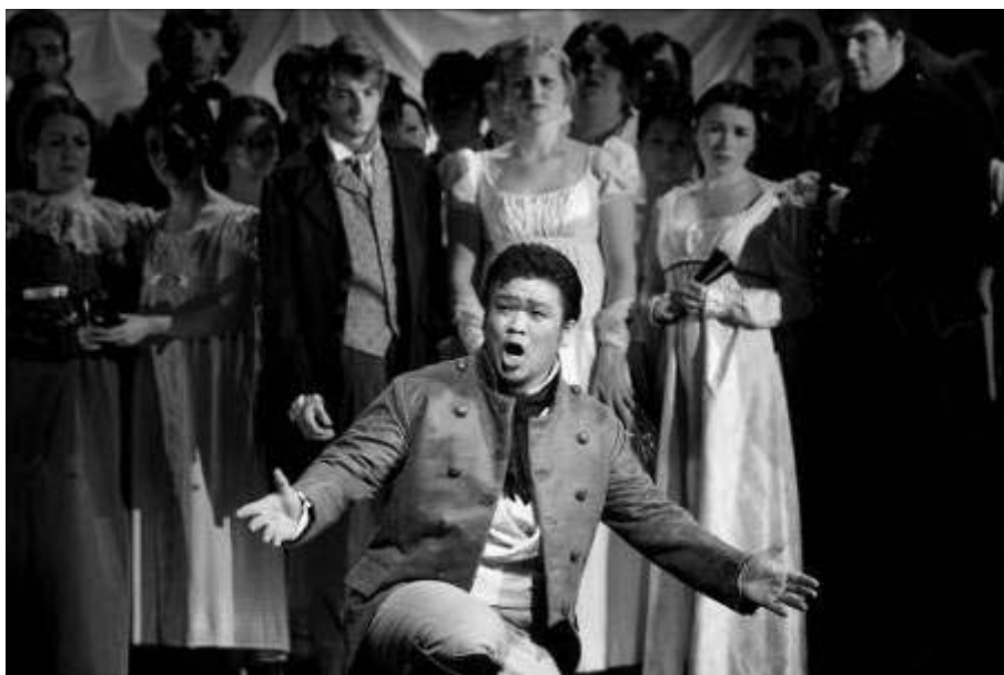
Eugene Onegin by Royal Scottish Academy of Music and Drama; 2008

Glasgow and Rostov have been actively and productively twinned for more than twenty years, this project aspires to develop and deepen the existing links by opening up concepts of identity and heritage as well as creative innovation. In fact Scotland and Russia have deep bonds of culture which stretch back over 300 years, and we are delighted to have a well developed understanding with our partners. This project hopes to demonstrate that when politics, diplomacy, and most recently, economics fail, intercultural dialogue is the most powerful tool we have in international relations. This project will work across several genres including opera, traditional and folk music, classical music and jazz. It will aim to widen interest and access to the arts to a range of stakeholders, targeting a range of ages and backgrounds.